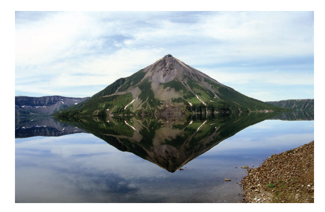
FIGURE 3 Kol'tsevoye lake located in Tao-Rusyr caldera. Since the caldera formed 7500 years ago, Krenitzin Peak stratovolcano has formed in the central part of the caldera. The 1952 crater and the lava dome are visible on the slope and at the foot of the volcano.

The Kuriles, in general, have a maritime monsoon climate influenced by sea currents (both cold and warm, Fig. 1) of the Pacific Ocean and the Sea of Okhotsk, as well as by air masses coming from eastern Asia or the Bering Sea region. The southern part of the Sea of Okhotsk is under the influence of the warm Soya sea current, whereas the cold Kamchatka current travels south along the Pacific coast. As a result, the climate of the western slopes of the largest southernmost islands, warmed by the Soya current and protected by high ridges from the cold Pacific, is close to subtropical. The climate of the eastern slopes is notably colder, resulting in strikingly different vegetation. The northernmost islands