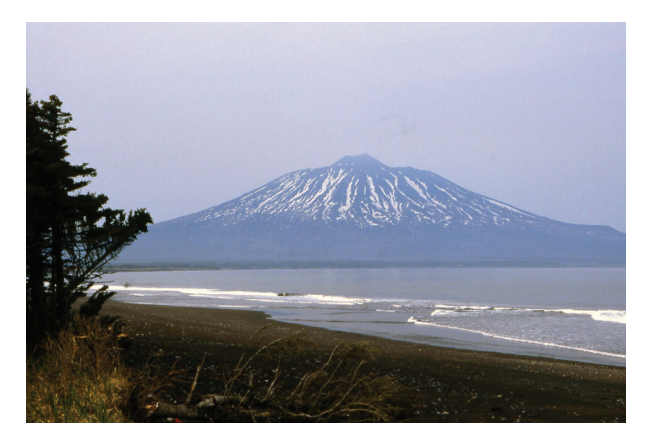
FIGURE 2 Tyatya volcano, Kunashir Island. View from the southeast from the Pacific coast.

Although rivers and lakes are common on the larger Kurile Islands, several small islands have no sources of drinking water. Island rivers are commonly short and rapid (whitewater rivers) with many waterfalls. The 140-m high Ilia Murometz waterfall on Iturup is one of the highest in Russia. Many of the lakes are located in volcanic craters and calderas. The deepest (>264 m) and most beautiful is Kol'tsevoye (Circular) Lake (Fig. 3), which is located inside the Tao-Rusyr caldera at Onekotan Island. Some lakes and rivers located in